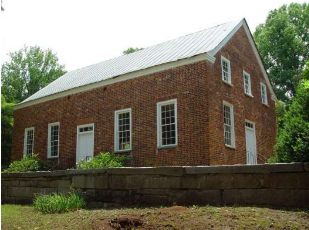
Ebenezer (Old Brick) Associate Reformed Presbyterian Church